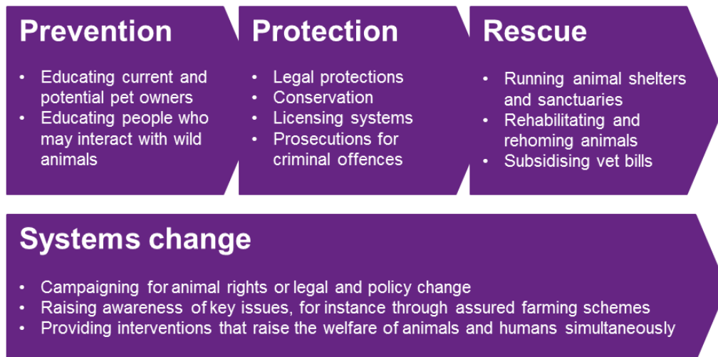
Figure 3: Priority solutions for domestic, farm and wild animals

Within the four categories shown in Figure 3, different sorts of organisation engage in different activities. For instance, hands-on rescue work is often undertaken by small, local charities, while larger charities tend to have more staff capacity and expertise to engage in campaigning and awareness-raising work. The different stages are not in competition with each other, as they have a common aim to improve the welfare of animals. It is important that there is funding for interventions at different stages: rescue operations can be complemented by a preventative, education-focused approach.